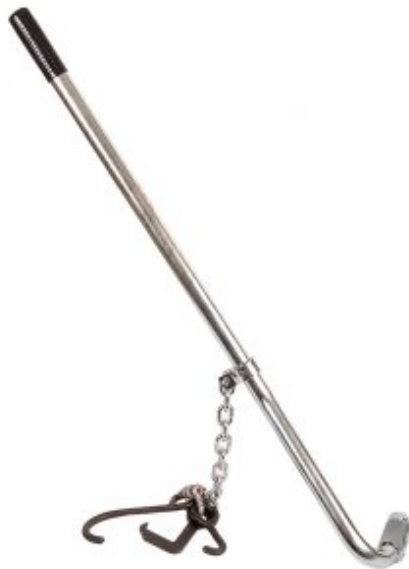
Utility Manhole Cover Lifter

click here to Buy Online @ CRAFTWORKTOOLS™