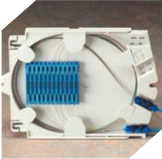
Compact 12-Fiber Splice Tray